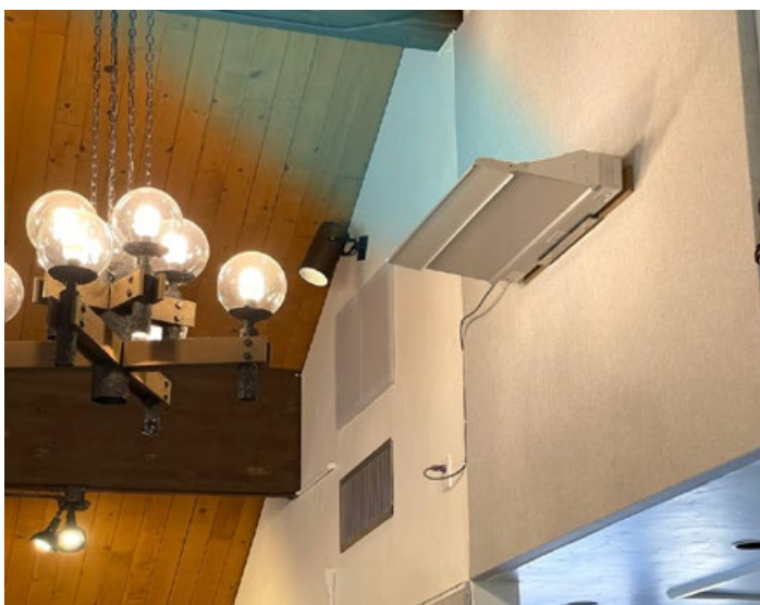
Installers used the GLO-1500 Open-Fixture's adjustable "director" to prevent any reflection of UV-C energy by the Church's decorative chandelier lighting.