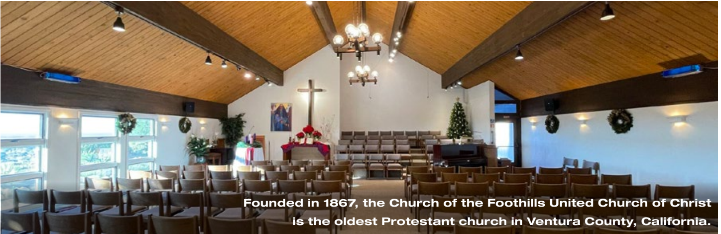
Founded in 1867, the Church of the Foothills United Church of Christ is the oldest Protestant church in Ventura County, California.