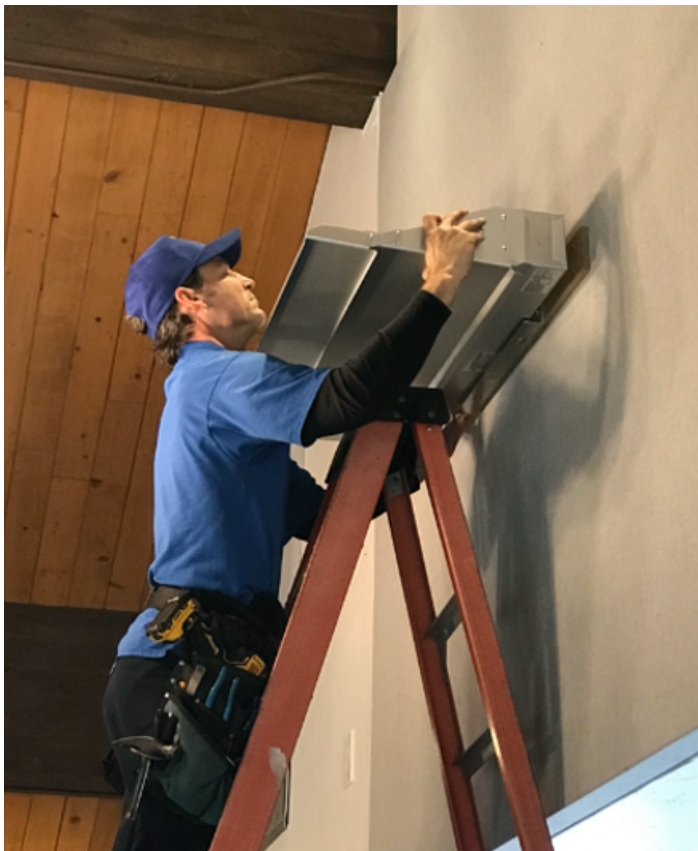
The UV disinfection fixtures are active when congregants are in the sanctuary and during choir practice.